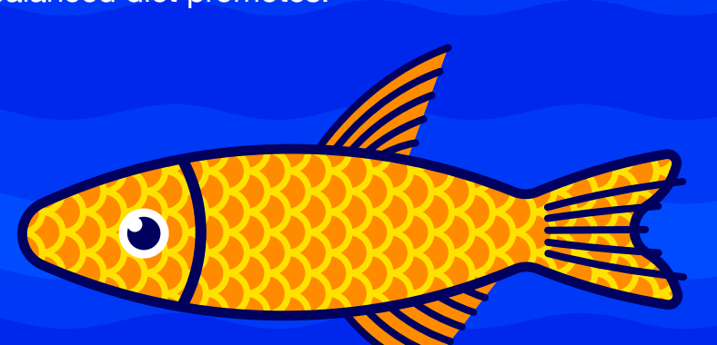
HEALTHY SKIN AND RADIANT SCALES

Tetra® nutrition helps your fish radiate beauty from the inside out. A steady, nutritionally balanced diet promotes: