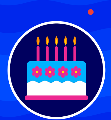
LONGER, HEALTHIER LIFE