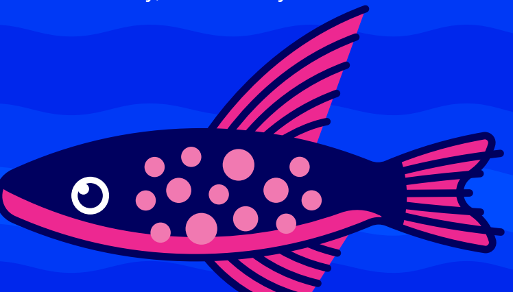
POWERFUL-LOOKING. HEALTHY FINS